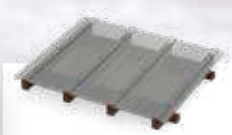
PANELS FOR PERGOLAS