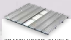
TRANSLUCENT PANELS FOR ZIPPED METAL ROOFING