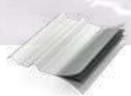
TRANSLUCENT ROOFING PANELS